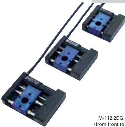
M-112.2DG, M-111.2DG, M-110.2DG (from front to back) providing 25 mm, 15 mm and 5 mm travel range