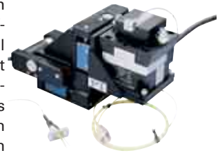
F-130 fiber alignment system consisting of an M-110 XYZ positioning system and a P-611 XYZ Piezo-Nano Positioning system. This combination can be operated by the C-880 controller or NI controllers (request our technote!)

nut system and gearhead. Both drive options provide a cost-effective solution for industrial and OEM environments. To meet the most critical positioning demands, the DC motor is equipped with a high resolution encoder featuring resolution down to 0.007 \mu\text{m} per count.